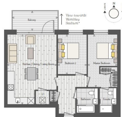
FLOOR 01 SHOWN