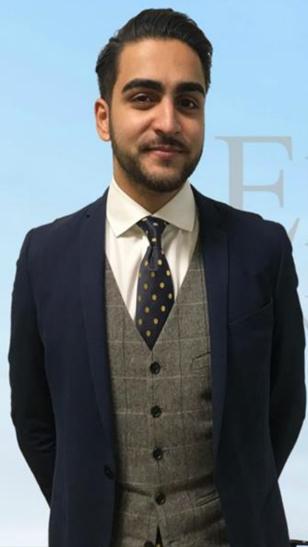
KIERAN SAVAGE NEW HOMES & INVESTMENTS