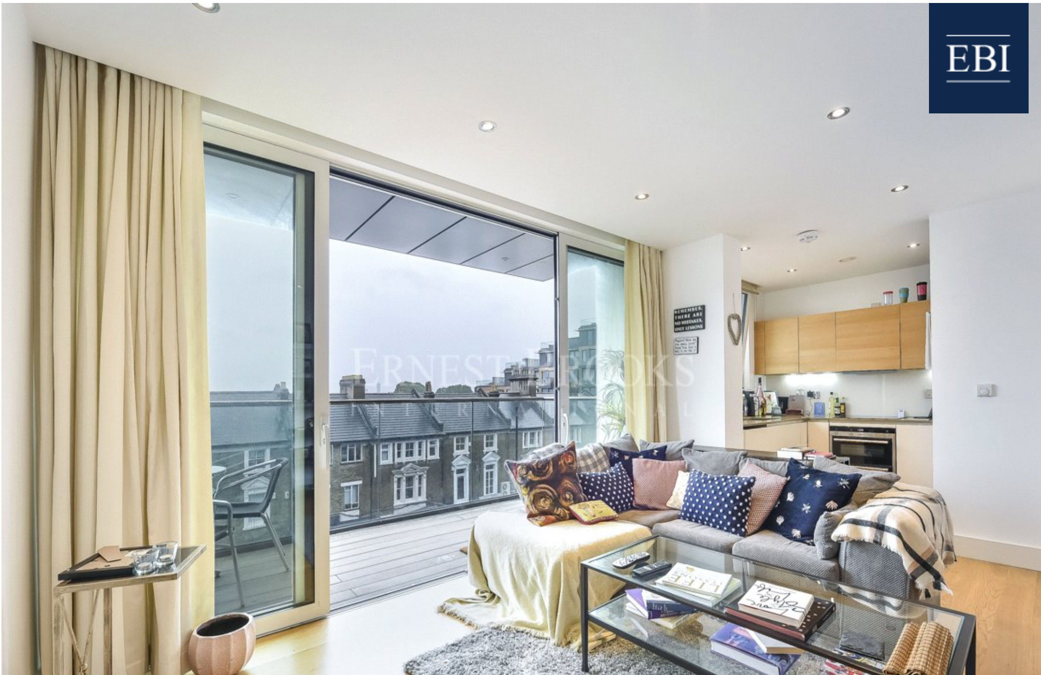
Rainsborough House, 5 Stamford Square, SW15 2BP